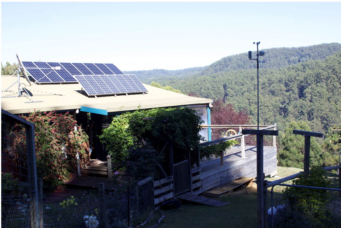
Our branch office at Apollo Bay

We have kept up to date with the latest developments and have made it a policy to keep our clients informed of relevant changes. The scope of our service has progressively developed to deal with the complex Government requirements applicable to industrial development in this country and New Zealand. We offer our clients comprehensive assistance relating to compliance with these regulations and have a successful track record of providing strong support for negotiations with statutory authorities.